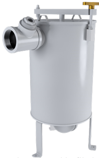
Image from Protectoseal. Series 782 air dryer. https://www.protectoseal.com/specialty-valves-and-fittings/

Moisture laden air enters the tank system when product is withdrawn, or when the vapor space of the tank cools. This moist air is dried by the desiccant in the dryer before it enters the tank.